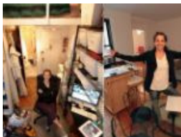
Movin' on up! Woman who was evicted from 90-sq-ft apartment...