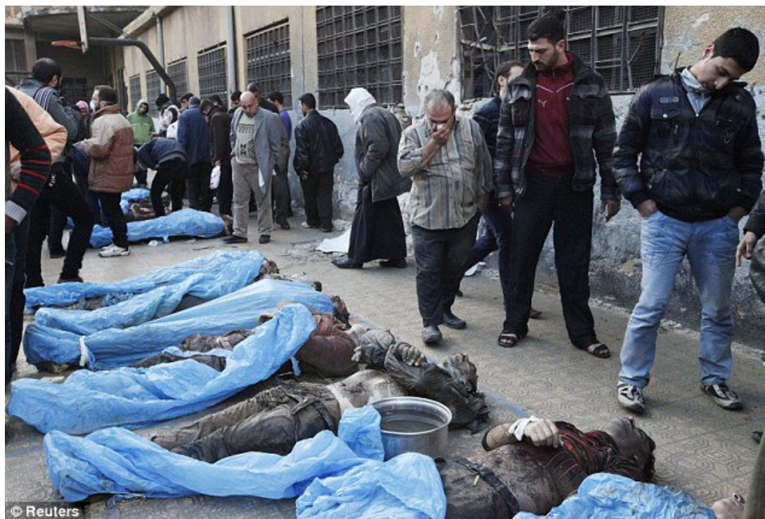
Countless losses: Families attempt to identify the bodies of Syrian fighters shot and dumped in a river in the northern Syrian city of Aleppo today

A spokesman said that the U.S. joined the international community in 'setting common redlines about the consequences of using chemical weapons'.