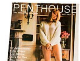
Naked pictures of Madonna and photos of 'Arnie's sex act':...