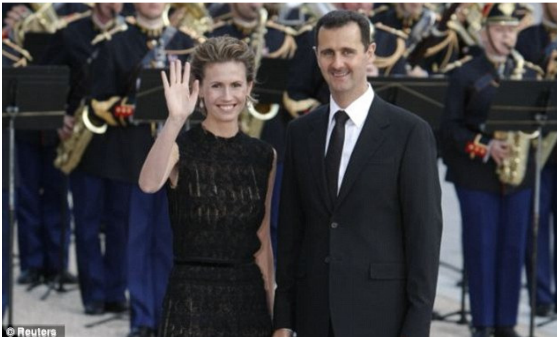
Tyrant: Syrian dictator Bashar al-Assad, pictured with his wife Asma, is facing increasing international pressure over his brutal massacre of his own people

Eye witness accounts from the investigation revealed that a tank launched chemical weapons and caused people exposed to them to suffer nausea, vomiting, abdominal pain, delirium, seizures, and respiratory distress.