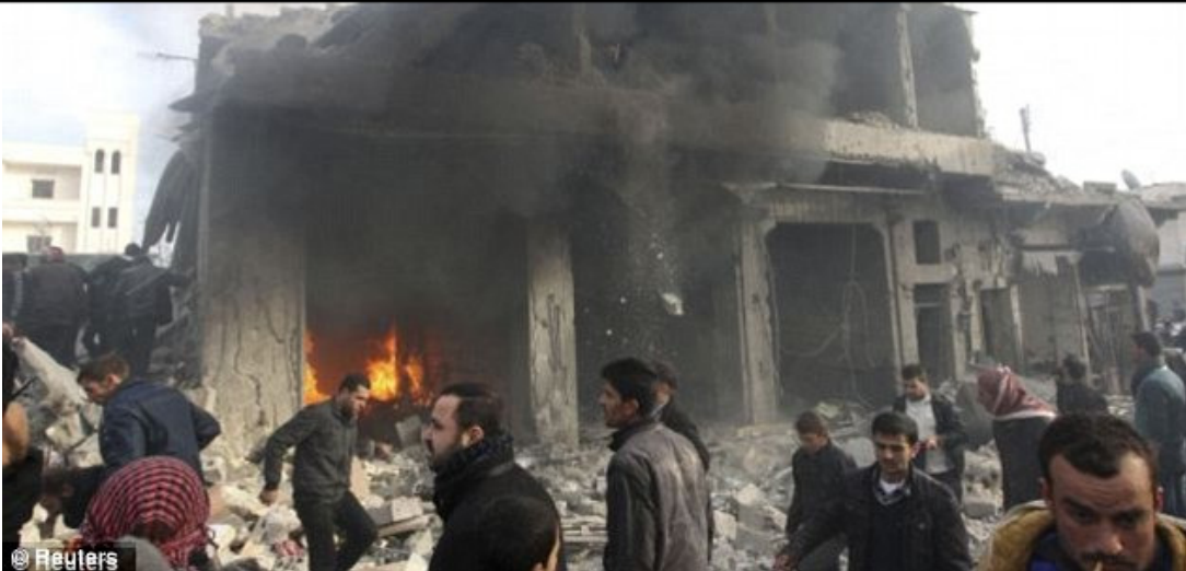
Devastation: People gather at a site hit by what activists said was missiles fired by a Syrian Air Force fighter jet from forces loyal to Assad, at the souk of Azaz, north of Aleppo on January 13

A leaked U.S. government cable revealed that the Syrian army more than likely had used chemical weapons during an attack in the city of Homs in December.