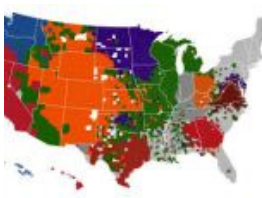
An enclave of Pittsburgh fans in Oregon? The surprising map...