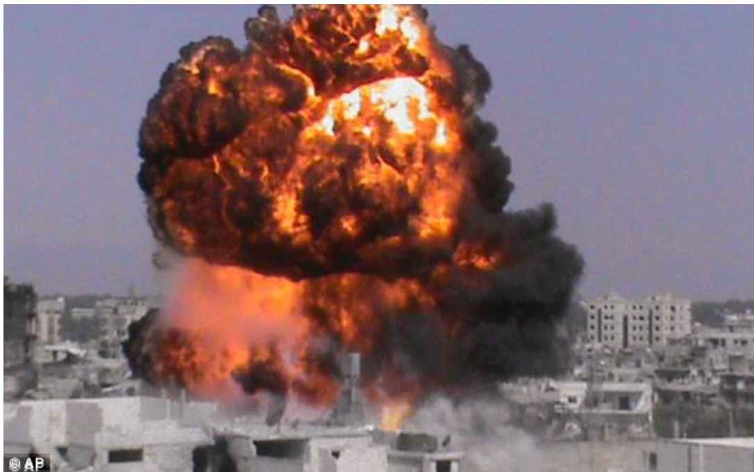
War games: An explosion in the Syrian city of Homs last month. It has been now been suggested that the U.S. backed the use of chemical weapons to spur international military intervention