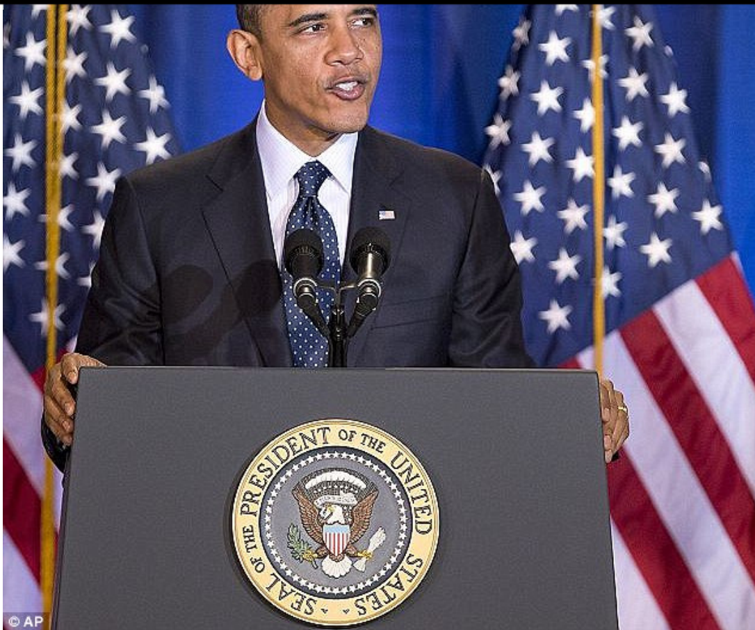
Threats: Barack Obama said during a speech last month that if Syria used chemical weapons against its own people it would be 'totally unacceptable'