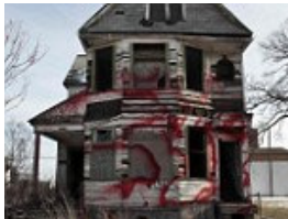
Blighted home that says Detroit is going bankrupt: Families...