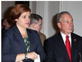
'Look at the a** on her': Mayor Michael Bloomberg shocks New...