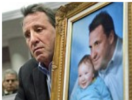
Parents of children slain in Newtown school shooting beg...